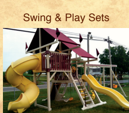
Swing & Play Sets