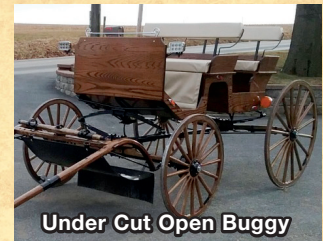
Under Cut Open Buggy