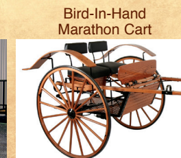
Bird-In-Hand Marathon Cart