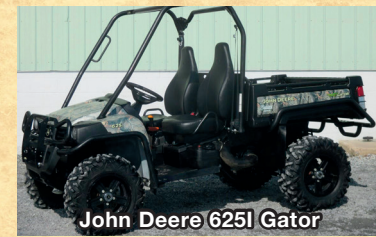
John Deere 625I Gator