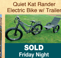
Quiet Kat Rander Electric Bike w/ Trailer