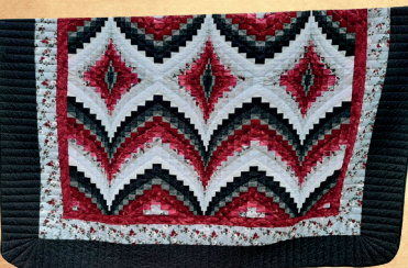
Diamond Echo Quilt