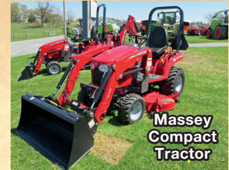
Massey Compact Tractor