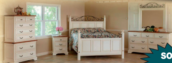
6 pc. Cambridge Queen Bedroom Suite White Glazed with Maple Tops