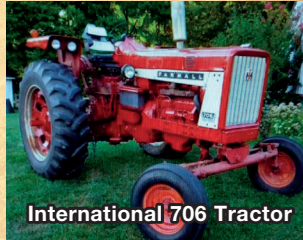
International 706 Tractor