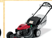
Honda 21" Self-Propelled Lawn Mower