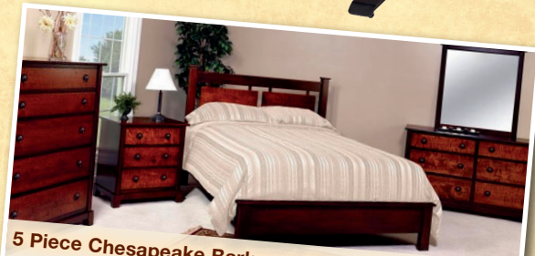
5 Piece Chesapeake Barkman Queen Bedroom Suite