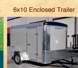
6x10 Enclosed Trailer