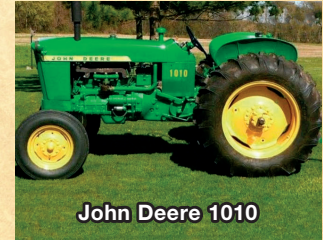
John Deere 1010