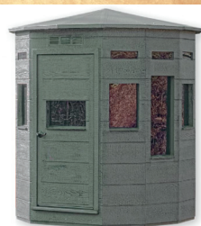
360 Degree Hunting Blind