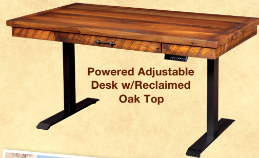
Powered Adjustable Desk w/Reclaimed Oak Top