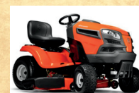
Husqvarna YTH1842 42" Riding Mower