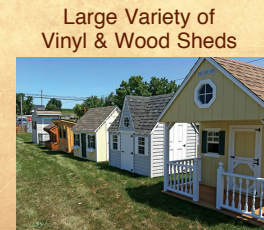
Large Variety of Vinyl & Wood Sheds