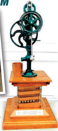
100th Anniversary 1/3 Scale Kurtz & Wanner Pump Marble Roller