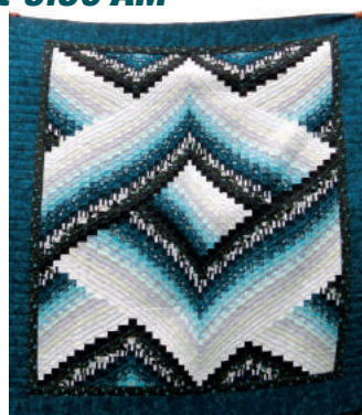
Hailey's Comet Quilt-Queen