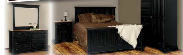
5 pc. Black Distressed Queen Bedroom Suite