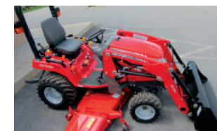
NEW Massey Ferguson 1705 w/belly Mower & Loader