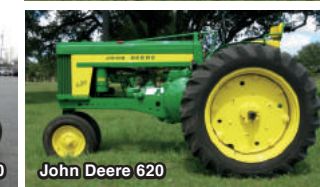
John Deere 620