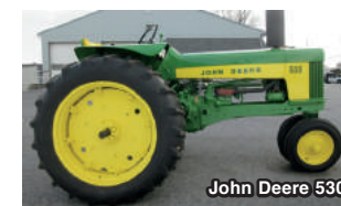
John Deere 530