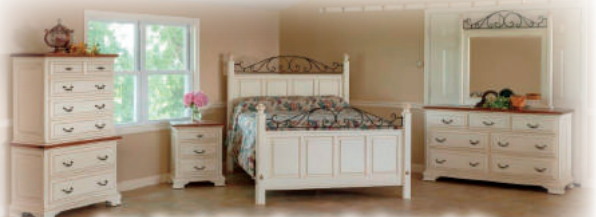
6 pc. Cambridge Queen Bedroom Suite White Glazed w/Cherry Tops