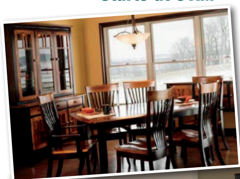
Matching Elm Wood Dining Set