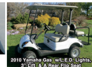
2010 Yamaha Gas w/L.E.D. Lights, 3" Lift & A Rear Flip Seat