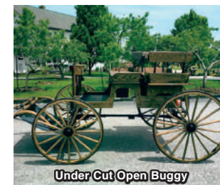
Under Cut Open Buggy